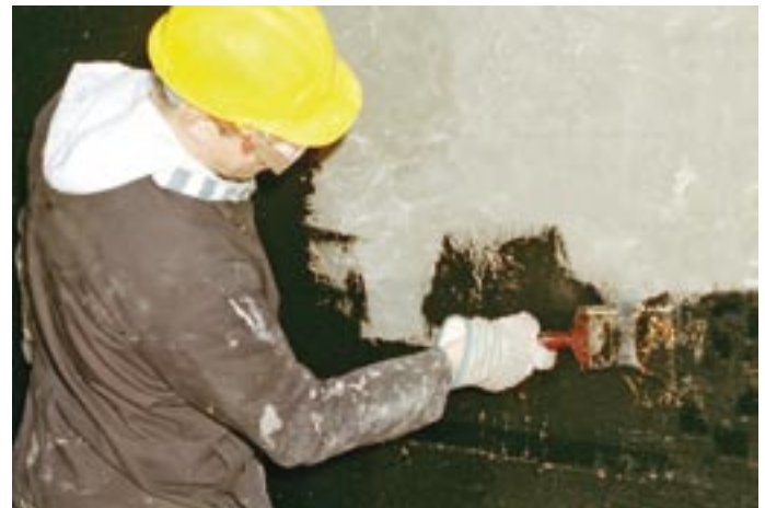
Application of Sika Poxitar F advanced coating system

To fully support both Milliken and their contractor, NWS also provided their Site Supervision