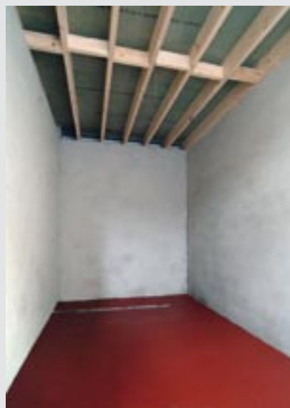
Picture taken at an intermediate stage prior to coving and finishing wall coating application

In addition to the floor specification and materials supplied, NWS was also able to introduce a quality orientated local specialist contractor – P J McGrath & Sons who have recently completed the project exactly as the client required.