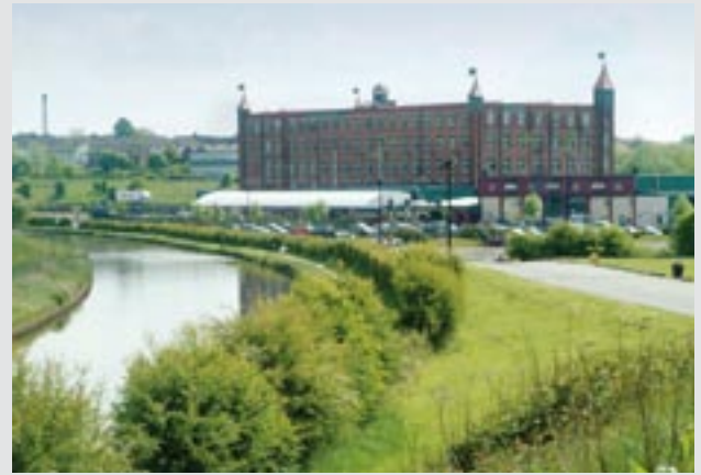
Botany Bay - 'The Retail Experience'

A winning formula – ensuring the client receives the right product to meet the specified requirements, backed up with comprehensive technical advice and support through to the completed application by a competent contractor. NWS can also help you achieve this in your business!