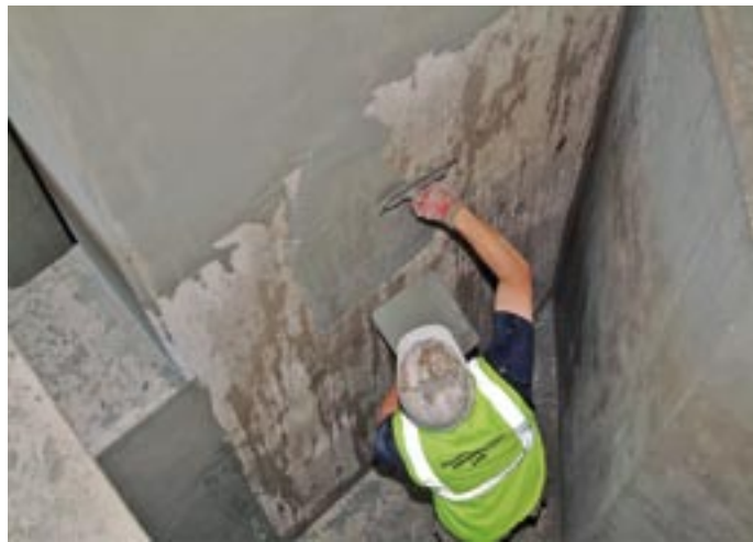
Construction Techniques Apply Sikagard 720 EpoCem

As part of their Odour Control Scheme implementation, United Utilities needed a chemically resistant containment bund lining, that had to be applied within days of striking the formwork from the ‘green’ concrete, so their Design and Management Contractor contacted specialists Construction Techniques.