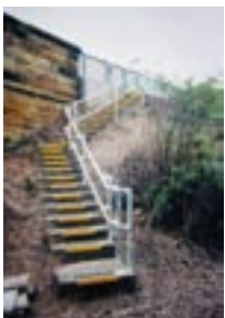
Slip resistant steps

Thus the building was able to obtain a fire certificate without major disruption, damage or disturbance to the occupants and their business.