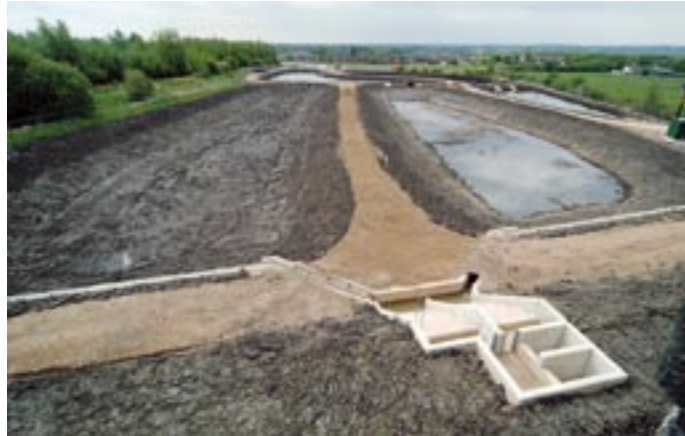
Settlement pools and wetland reed beds taking shape