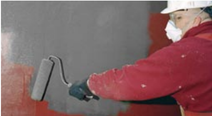
Chemically resistant SikaGard coating being applied

R enovate Services Ltd, the specialist refurbishment and industrial coatings contractor, as part of their on site term contract work for the British Nuclear Group, have recently completed several critical projects in Nuclear Facilities around the North West, with the assistance and support of NWS.