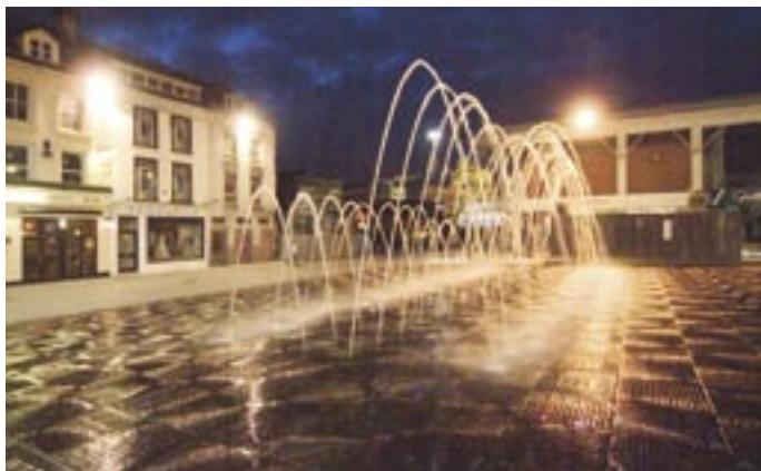
Williamson Square Fountain at night